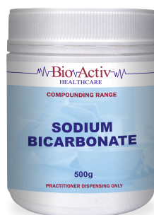
Sodium BiCarbonate 500g $10.16