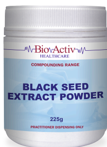
Black Seed Extract Powder 225g $31.48