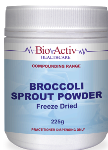
Broccoli Sprout Powder 225g $36.29