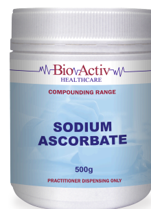
Sodium Ascorbate 500g $22.50